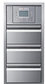
Controller Drawer - Three Stack VGC15DBC3