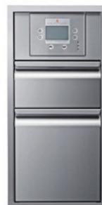
Controller Drawer - Two Stack VGC15DBC2