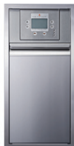
Controller Drawer - Trash VGC15BWB/C