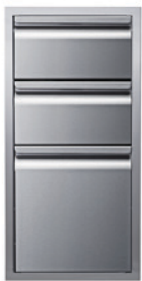
Three Drawer Stack 15" VGC15DB3