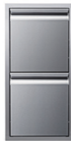
Two Drawer Stack 15" VGC15DB2