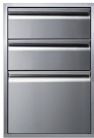
Three Drawer Stack 21" VGC21DB3