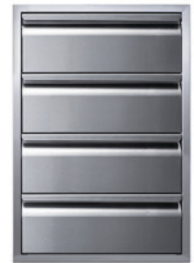
Four Drawer Stack 21" VGC21DB4