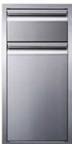
Single Drawer and Trash Drawer 15" VGC15BWB1