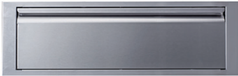
Lower Drawer Elite VGC42LD1