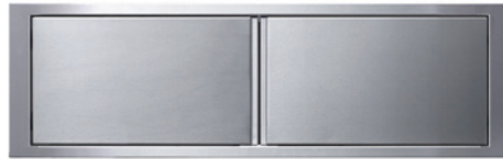
Lower Doors Elite VGC42AD