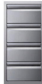
Four Drawer Stack 15" VGC15DB4