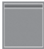
Vertical Access Door VG21SB