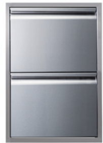
Two Drawer Stack 21" VGC21DB2